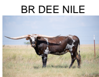
BR DEE NILE