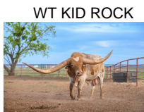
WT KID ROCK